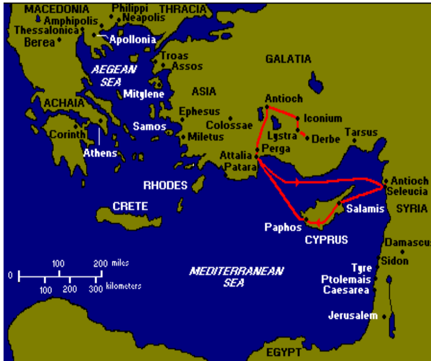
1 st Trip