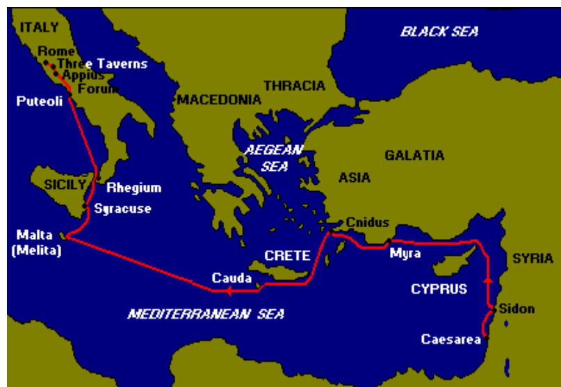
4 th Trip