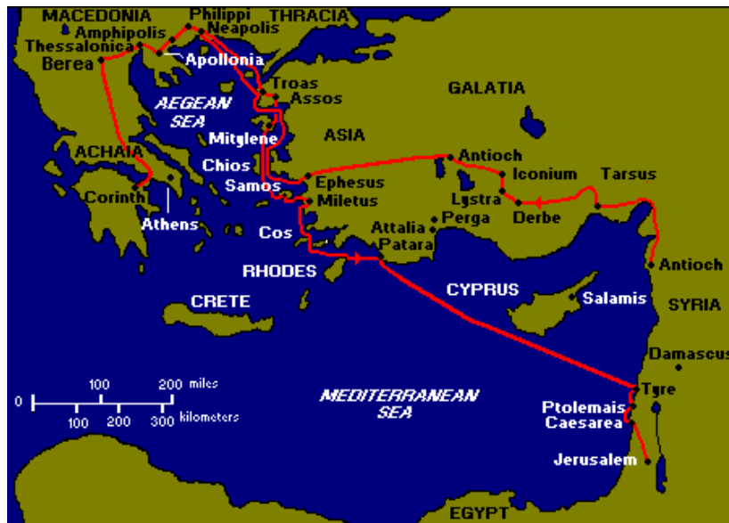
3 rd Trip