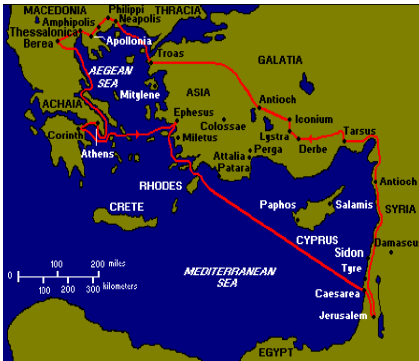
2 nd Trip